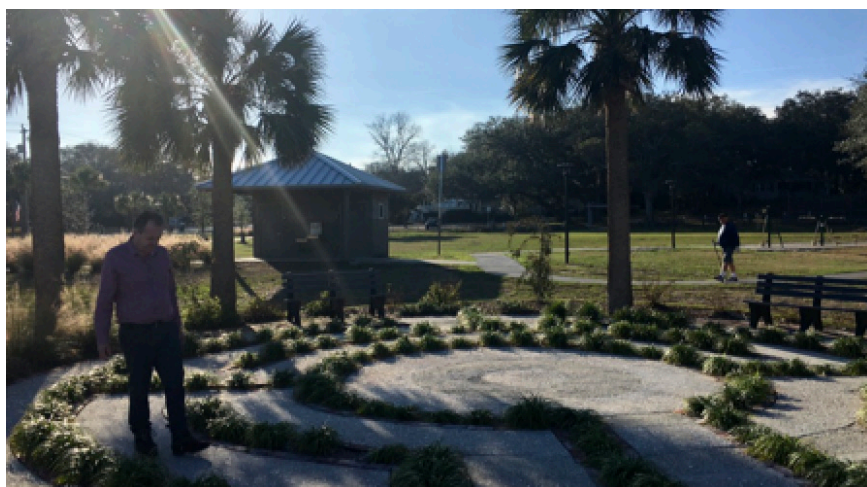
A Classical labyrinth.