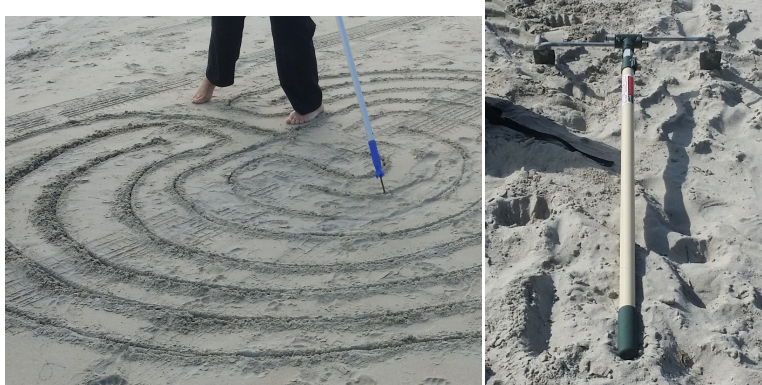
Making a labyrinth in the sand with a broom handle and metal point, and a clever "twin groove" making tool made from two trowels and a paint roller.