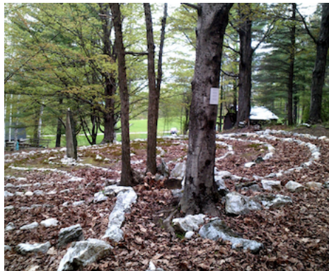
Labyrinths often sit well with, if respecting, trees